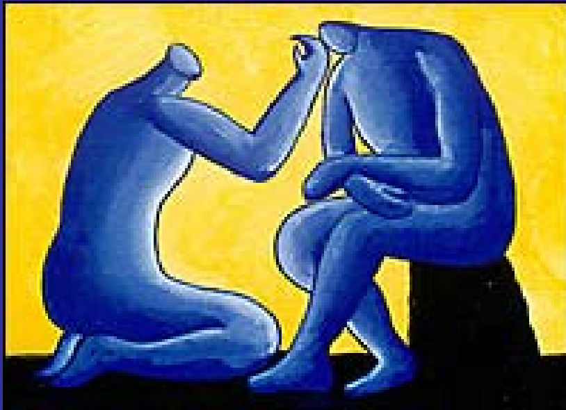
"The healing touch" by Michele Angelo Petrone